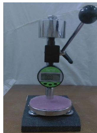
Figure 1: Shore A hardness durometer testing kit.

Sample preparation and measurement for Shore A hardness were done according to the ISO standards 7619 (14) . Seven samples for each group were constructed from a plastic mold with a diameter of 50 mm and a thickness of 6 mm; the mold was placed on a glass slab, filled with the alginate, and covered by the second slab. The pressure was applied manually until the two glass slabs were in contact with the mold to ensure even alginate thickness during gelation, then 5 kilograms of weight was placed over the slab until the setting was complete. After 10 min, the alginate discs were carefully removed. Each sample was divided into six equal zones; one measurement was made for each zone. Digital Shore A Hardness Durometer tester kit (Yueqing ABE model LX-A-4. China), as shown in Figure 1, was used to measure the hardness of the samples that were loaded with 10 N for 15 seconds, the mean of the six measurements was considered as the value of the Shore A hardness.